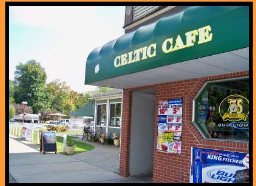
Articles on Pages 6 & 7