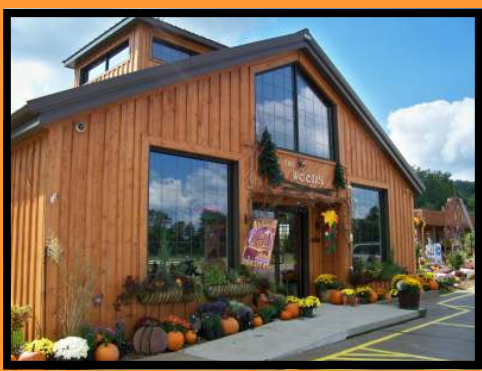
The Woods ~ Wyattville Country Store