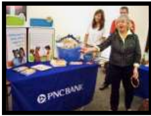
PNC Bank* Feldman Jewelers*