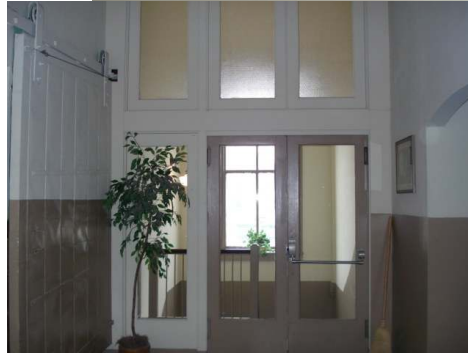
Inside the new Lamberton Building apartments on 13th Street. (Top) The hallways of the Lamberton Building have also undergone improvements. (Left)

Deep Harbour rents office spaces of various sizes in the Liberty Building. The building's upper stories had been largely unused, but Deep Harbour continues to add new tenants has done extensive renovations to the lobby, including a new elevator and some decorative touches in order to make the building more appealing to their business tenants. Some tenants prefer to decorate and equip their own office spaces, while others ask for specific amenities. Deep Harbour works with all requests to give clients the look and feel they want at an affordable, all-inclusive price.