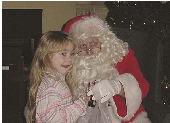
The Santa luncheons held at the Franklin Elks Lodge are a favorite Rotary program each year.

Traditionally, the Franklin Rotary has raised money throughout the year and used it to provide grants to fund several small projects. The club refocused in 2007 though, deciding to complete larger initiatives like the renovation of the Barrow-Civic Little Theatre. The group volunteered to repaint and carpet the little theatre, giving it a brand new look. The project was finished so quickly and met with such success that the group decided to help out with painting and cleaning the third story ballroom at DeBence Antique Music World. A grant for supplies was secured from the Rotary District and the DeBence Board cooperated in the project, but the real value of the Rotary aid was in the manual labor provided by members that helped ignite more excitement for the project. As further dedication to the DeBence project, Rotary committed to raise $7,000 for a contractor to refurbish the ballroom ceiling - a project that extends beyond any Rotary member's expertise.