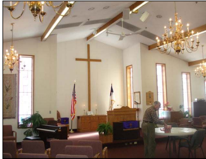
The chapel and the art gallery are just a few places where residents can relax and enjoy themselves.