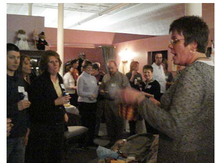
Annie's Bridal Shop

Our first mixer of the year was a great success at Annie's Bridal Shop . Close to 100 guests enjoyed drinks and appetizers and door prizes, and browsed Annie's collection of formal wear at the full-service bridal, alterations and costume boutique at 1269 Liberty Street in Franklin. After Hours mixers are a great opportunity to meet your fellow business leaders and to showcase your business. Call the Chamber at (814)432-5823 to schedule an After Hours at your business.