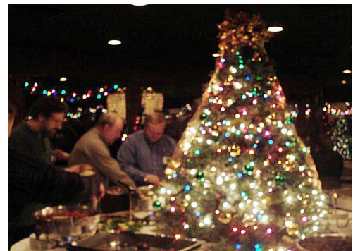
Cross Creek Resort

Venango Area, Titusville and Meadville Chambers also provided a way for our members to make important business contacts in neighboring communities. Thank you to all of our members who hosted Business After Hours mixers in 2007. We look forward to getting a closer look at some more member businesses in 2008.