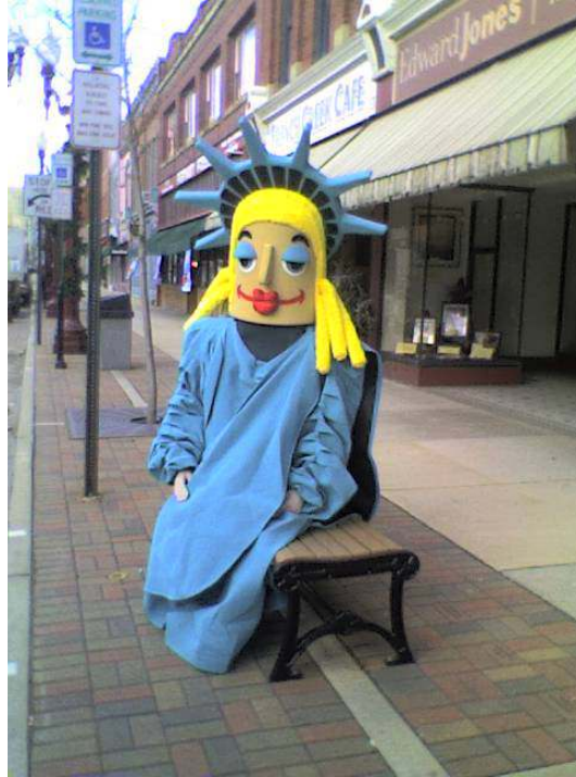
Liberty Tax Service uses guerilla marketing to get the word out about their business.