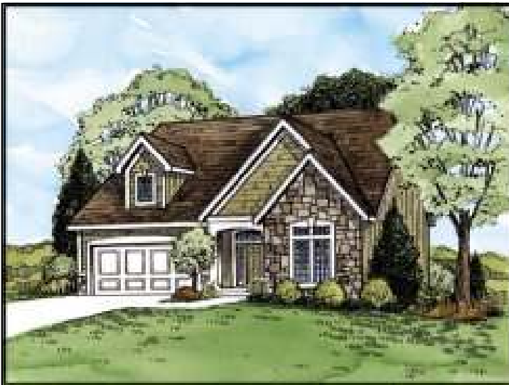
Artist's rendition of a single family (above) and a multiple family home (below) at Terra Alta.