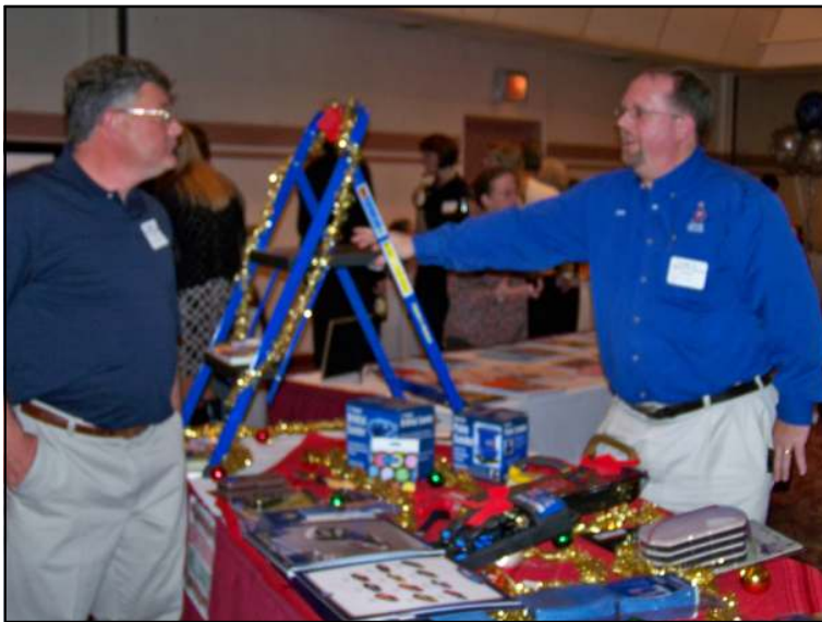
Another Successful Business After Hours mixer!

Well over 200 members turned out for the annual holiday kick-off Business After Hours mixer in November, hosted by the Franklin Retail & Business Association, Gent, Gent & Snyder, and the Quality Inn & Conference Center. Members of the retail association set up tables to display unique gift items to give attendees some holiday shopping ideas, and remind customers what great items can be found close to home.