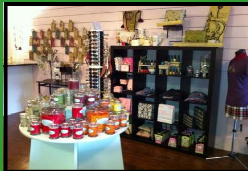
Pink Champagne Cupcakery