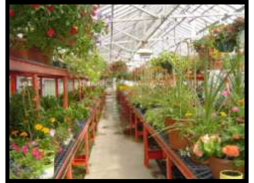
^ Inside the Greenhouse

Finally, individuals can participate in the sub-contract workshop and be involved with the industrial process by sorting, counting or even