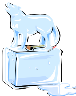
Photo Contest Announcement Party - 3 to 5 p.m., Victorian City Art & Frame

DeBence Antique Music World $5 Tours - 11 a.m. to 4 p.m.