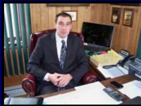
Penn North Financial Services