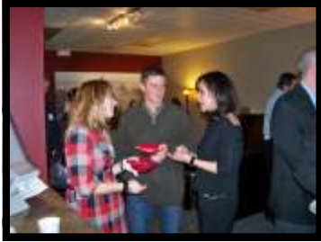
Bossa Nova Café & Roastery

Bossa Nova Café & Roastery hosted our January mixer, and we had a great time networking with more than 100 members! Business After Hours events are a fabulous way to meet your fellow members and build your network.