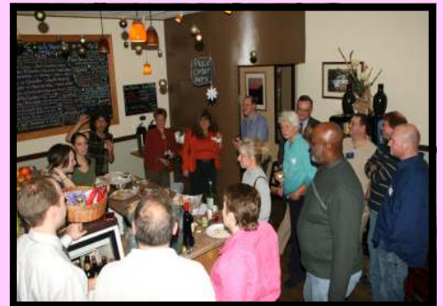
Articles on Pages 6 & 7