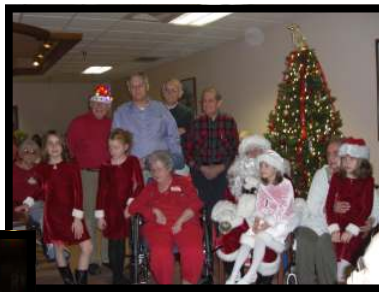
Kiwanis members took part in the Light Up Night parade and hosted a party at Sugar Creek Station last Christmas.

number by at least 10% in 2010. The group raises money each year through memberships, rentals of its hall on Takitezy Road in Sugarcreek, its popular Diner's Club Card sales, and several other fundraisers. In 2009, the club earned $17,000 through fundraising efforts that was all funneled back into the commu-