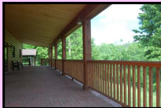
Kiwanis Club of Franklin