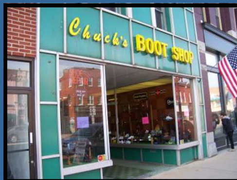
Chuck's Boot Shop